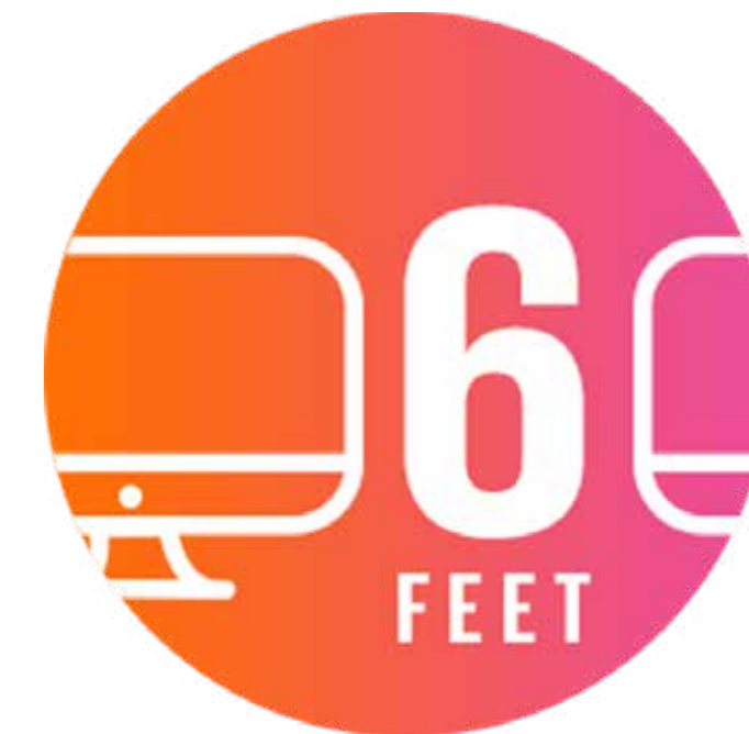
6FT APART all worksations set up