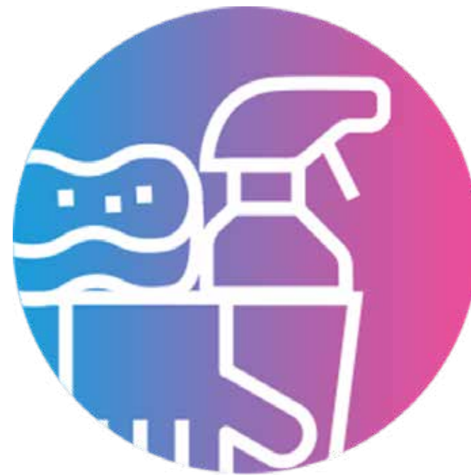
THOROUGH CLEANING work space during wrap