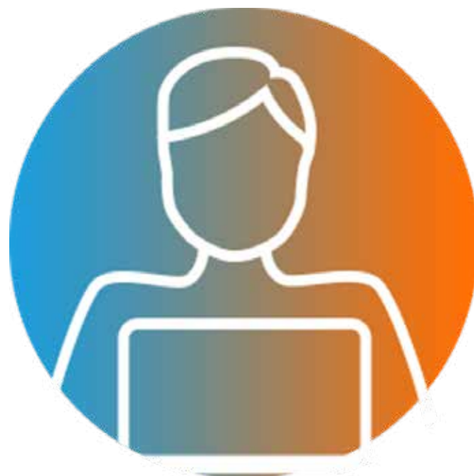
REMOTE VIEWING and communication available