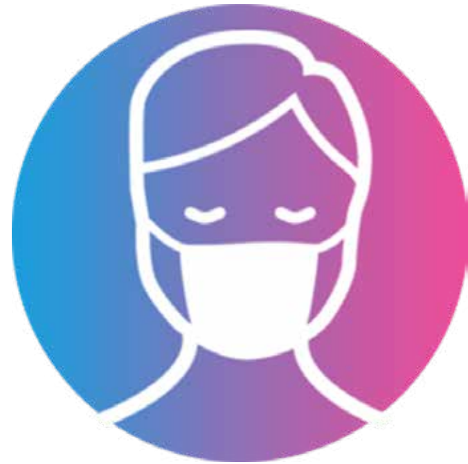
FACE MASKS to be worn