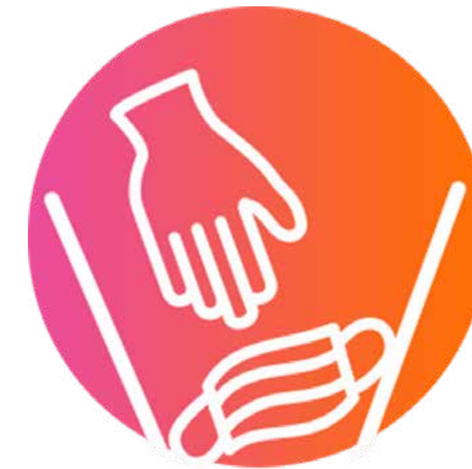
PROPER DISPOSAL of PPE