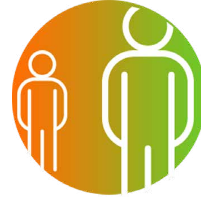
LIMIT ATTENDEES to essentials