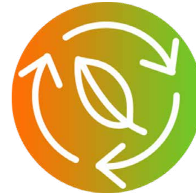
ZERO WASTE practices for green studio & productions whenever possible