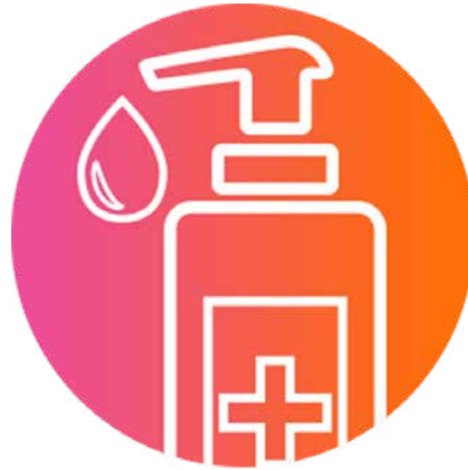
HAND SANITIZER available throughout studio