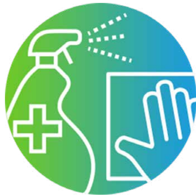
TOUCHPOINT cleaning throughout the day